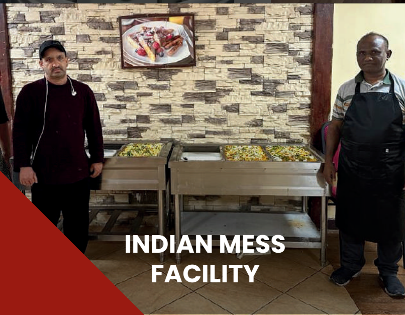
INDIAN MESS FACILITY